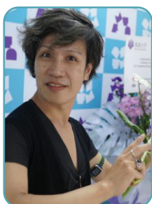
Kei-ichi Zempo Institute of System and Information Engineering

“Choose experiences that hone your skills by crossing” boundaries, not just sticking to your specialty!