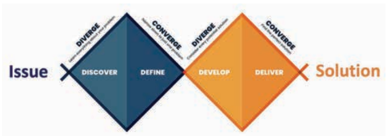
The double diamonds of the design thinking (UK Design Council)

We cultivate talent who, grounded in data science, broadly apply the concepts and techniques of natural sciences and humanities and social sciences to environmental and social issues, and creatively contribute to solving global challenges while incorporating design thinking.